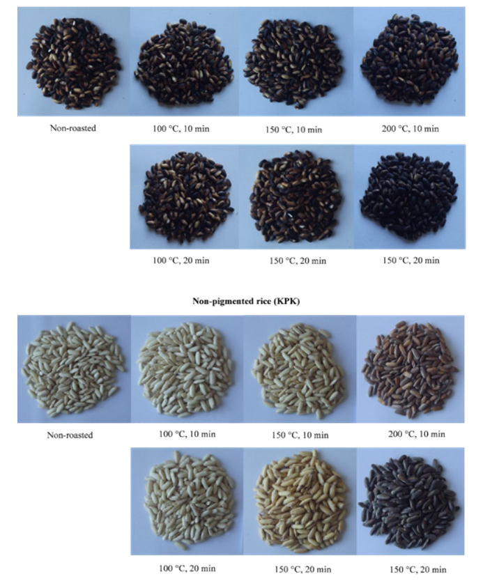
Figure 1. Appearance of non-roasted and roasted grains at different times and temperatures, in pigmented and non-pigmented rice varieties.